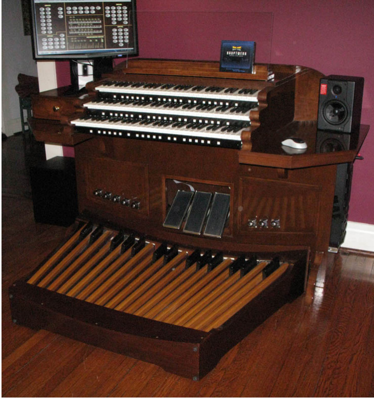
Example 1. A professional organist's practice instrument.

Here we show examples of what we have done and what we can do. Whether it is a complete Hauptwerk based virtual pipe organ, the conversion of a name brand organ to a Hauptwerk VPO, a sound engine for an existing organ or, a new console for your claviers, Organtechnology™ can meet your need.